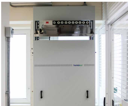
Wall mounted Stulz BNB ultrasonic humidifier with bespoke Humideco shroud to match nearby CRAC units.

Humideco, low energy humidification specialists, proposed a scheme for both sites that consisted of Stulz BNB wall mounted ultrasonic humidifiers, located within walkways around the data halls. The equipment was installed by Humideco's own project team, along with all water services, electrical and BMS work, and within a period of 9 weeks across both facilities. Each of the 76 individual humidifier systems has its own PLC control, enabling the desired room condition to be set locally.